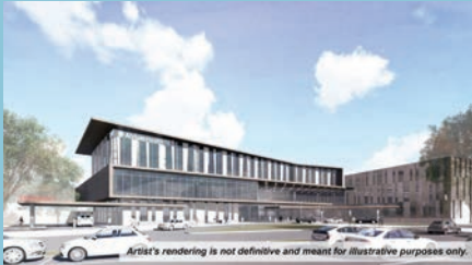
Artist's rendering is not definitive and meant for illustrative purposes only.

Upon approval and estimated completion in early 2022, Atrium Health Union West will be an approximate 150,000 square foot facility.