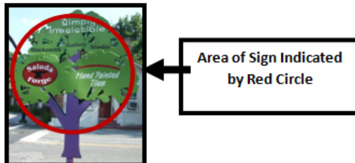
Example Illustrating Measurement of the Area of an Irregularly Shaped Sign

SIGN AREA. The size of a sign in square feet as computed by the area of not more than two standard geometric shapes (specifically circles, squares, rectangles, or triangles) that encompass the shape of the sign exclusive of the supporting structure.