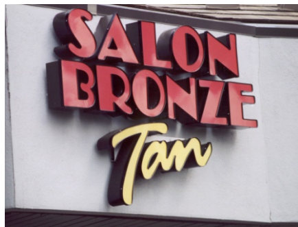
Example of Channel Lettering

CHANNEL LETTERING. A sign design technique involving the installation of three-dimensional lettering against a background, typically a sign face or building façade.