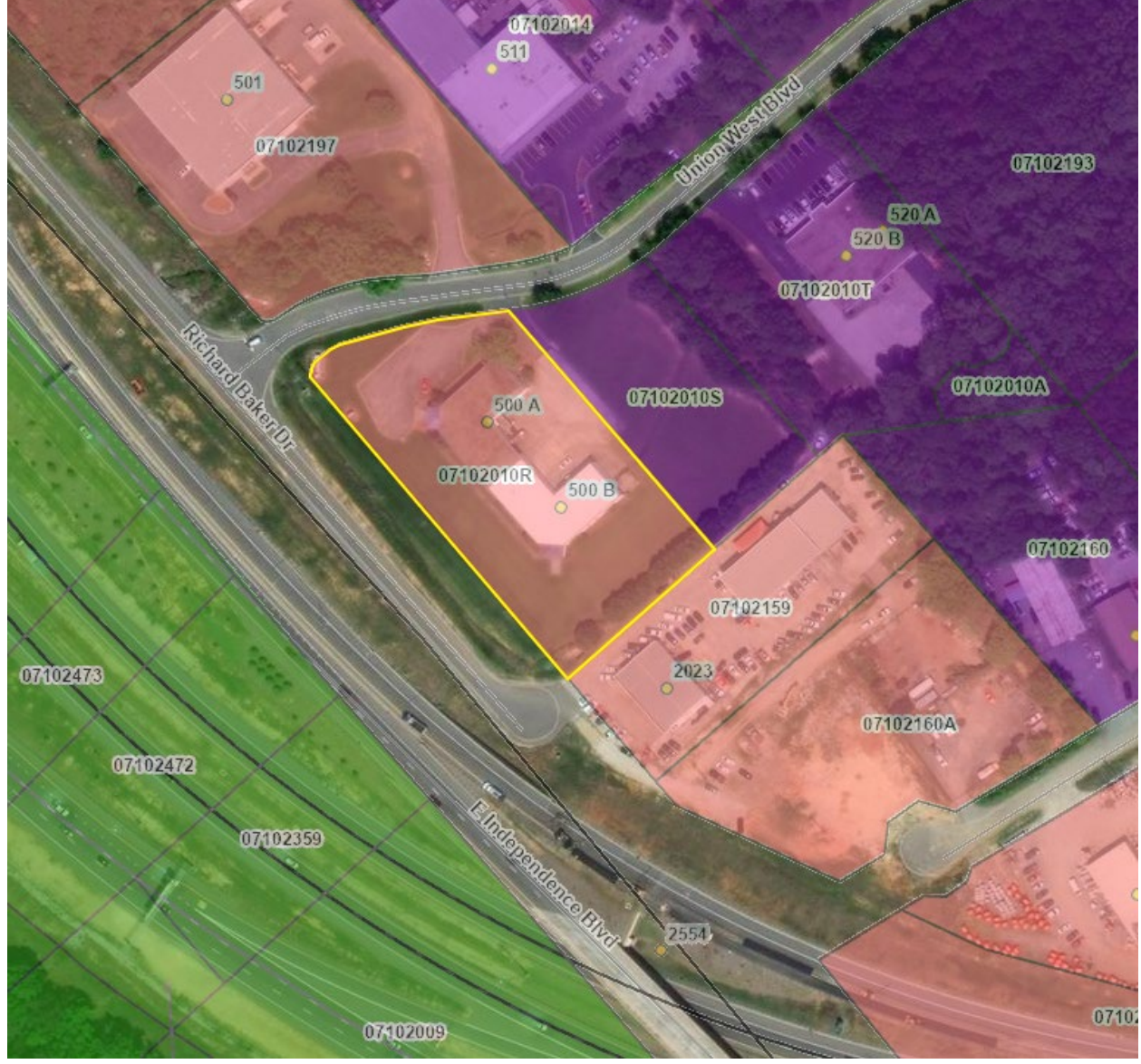
Figure 3: Zoning Districts