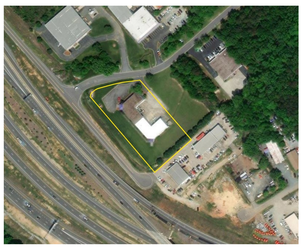
Figure 2: Aerial