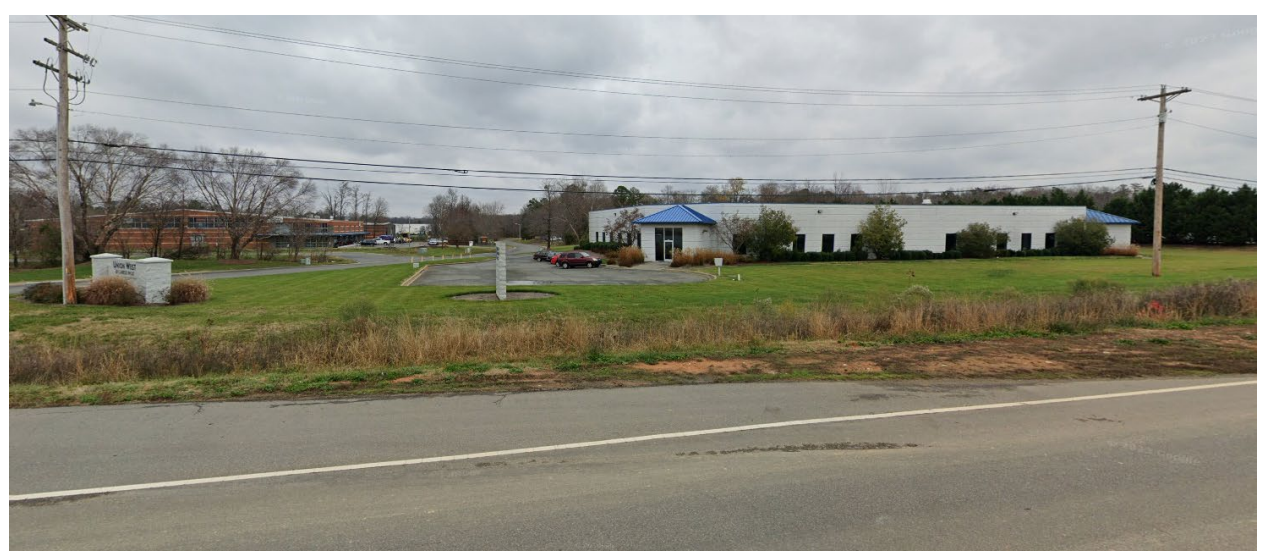
Figure 1: Street View