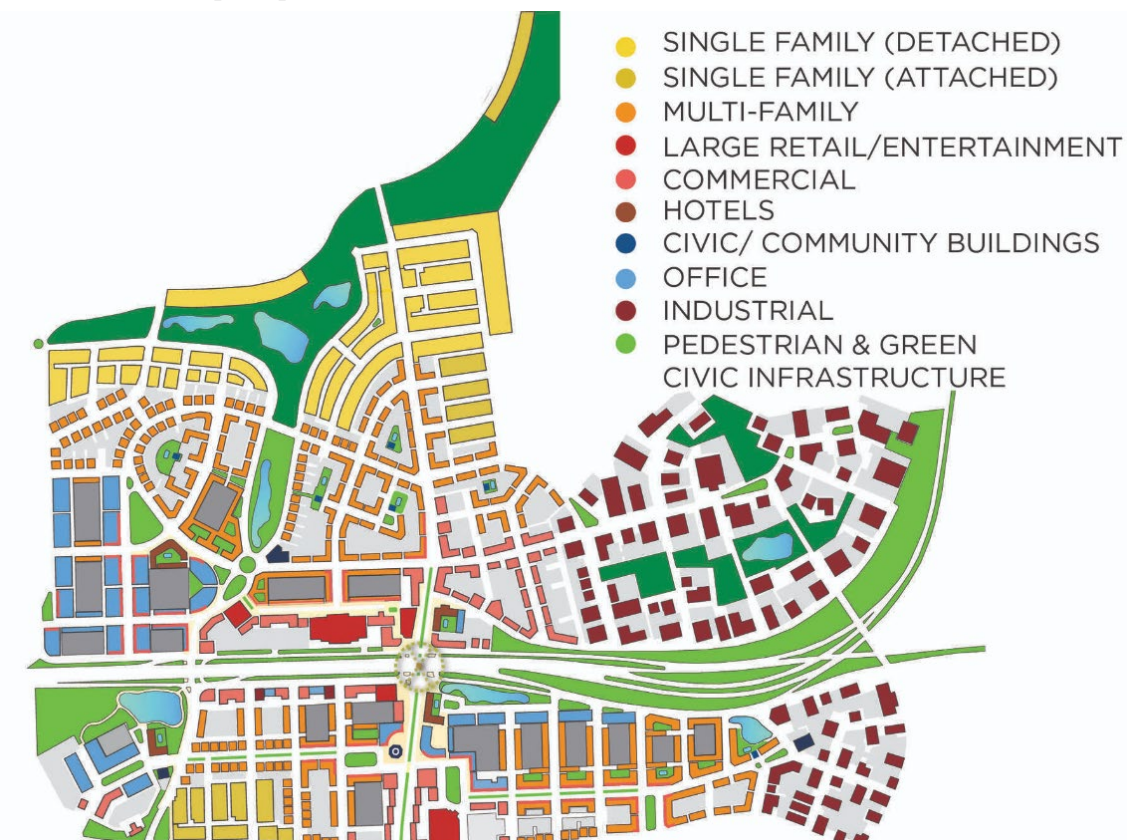
Figure 5: Monroe Expressway Small Area Plan

The Monroe Expressway Corridor Small Area Plan identifies this area as Industrial and this rezoning request is consistent with the adopted plan.