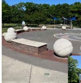
(Stallings Municipal Park)

Providing a unique district for civic and institutional uses will establish uniform standards. Parking should not be the dominant visible element of the campuses developed for institutional uses.