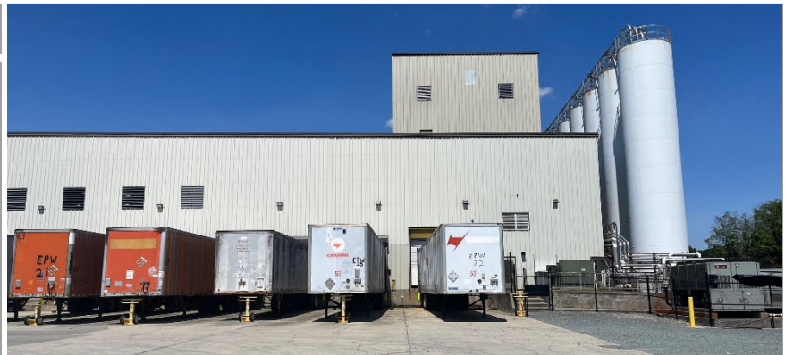
(Berry Global, 303 Seaboard Dr)

The Industrial District is reserved for uses that require large buildings and/or parking and loading facilities.