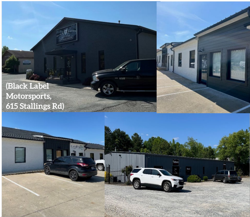
(Black Label Motorsports, 615 Stallings Rd)

This district is reserved for uses which require broad maneuvering spaces and avoid pedestrian interaction with potentially hazardous conditions. Uses in this district include heavy commercial goods and services for motor vehicles and some limited industrial purposes.