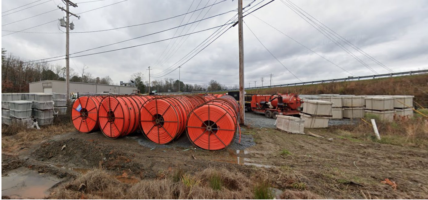
Figure 1: Street View