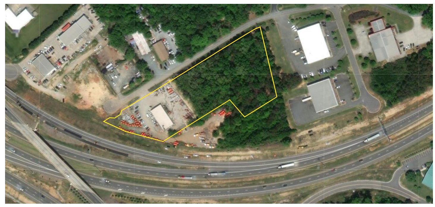
Figure 2: Aerial