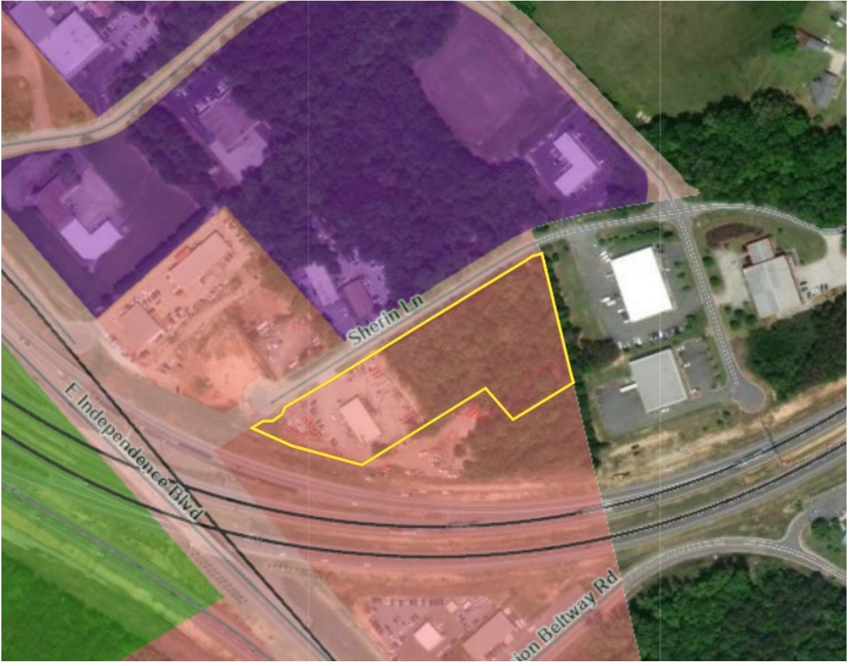
Figure 3: Zoning Districts