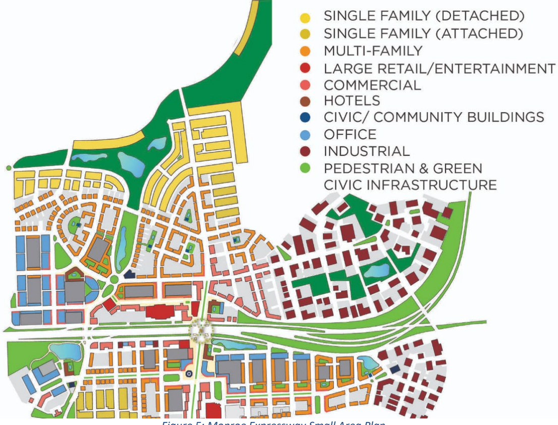
Figure 5: Monroe Expressway Small Area Plan